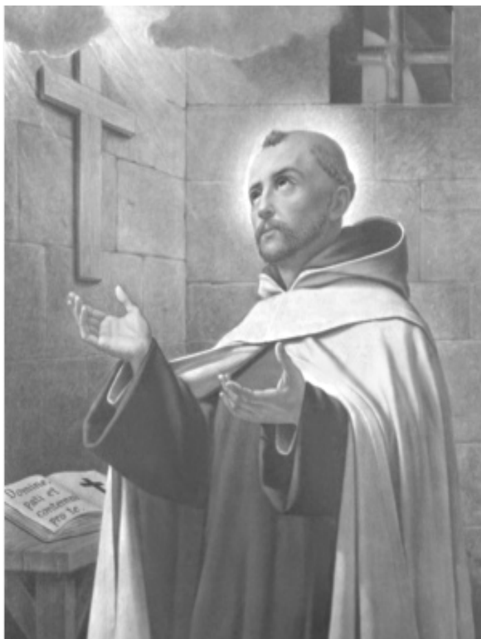
St. John of the Cross—Pray for Us