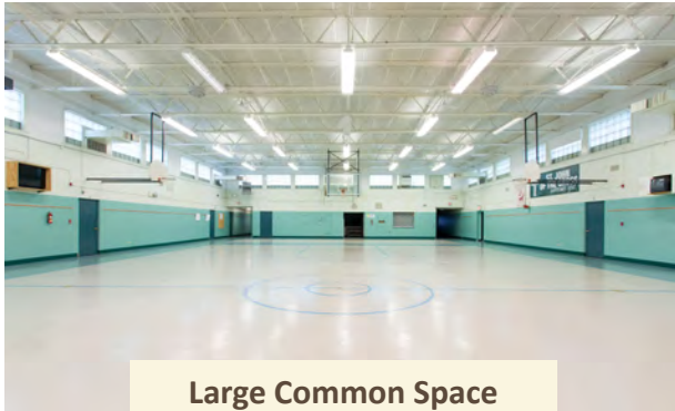
Large Common Space