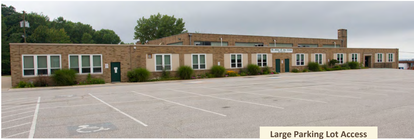
Large Parking Lot Access