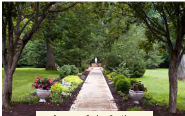
Serene, Quiet Setting

Located on the beautiful grounds of Saint John of the Cross Catholic Parish. Easily accessible from I-90, 15 minutes from downtown. A must see! Terms are negotiable. Property owned by the Catholic Diocese of Cleveland.