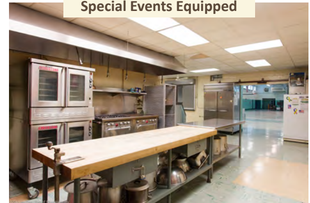
Special Events Equipped